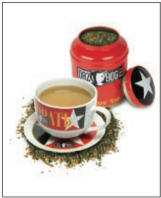
DAZBOG Packaging (China and Tin)