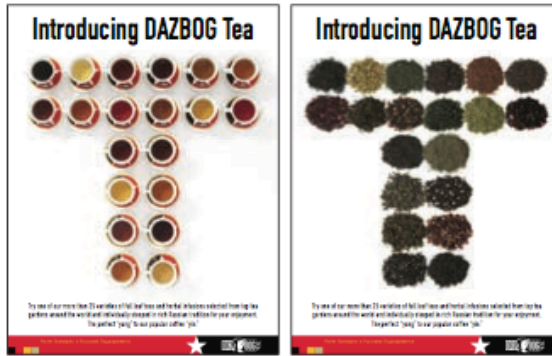
DAZBOG Promo Poster